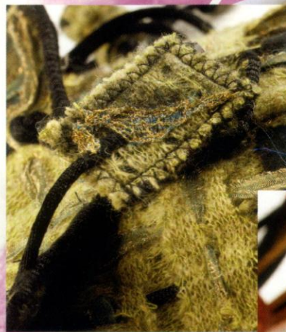
Textured felt tubes for a one-off piece of jewellery

Janome's new Xpression model is available at your local stockist. Ask for a demonstration.